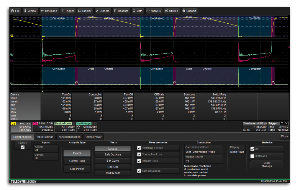
Switching transitions, conduction losses and off-sate losses are color-coded and automatically calculated. Measurements are displayed as energy (joules), mean or peak power (watts). For discontinuous supplies, off-state loss provides an excellent tool to fine adjust a current probe's DC offset and improve measurement accuracy.

Gain insight to circuit performance by seeing SOA plots to look for violations in the first cycles after an event or over long time periods. Finding SOA violations that occur for only a few cycles after an event, such as short circuit or startup, can be problematic. These violations often go undetected, and degrade the device over time.