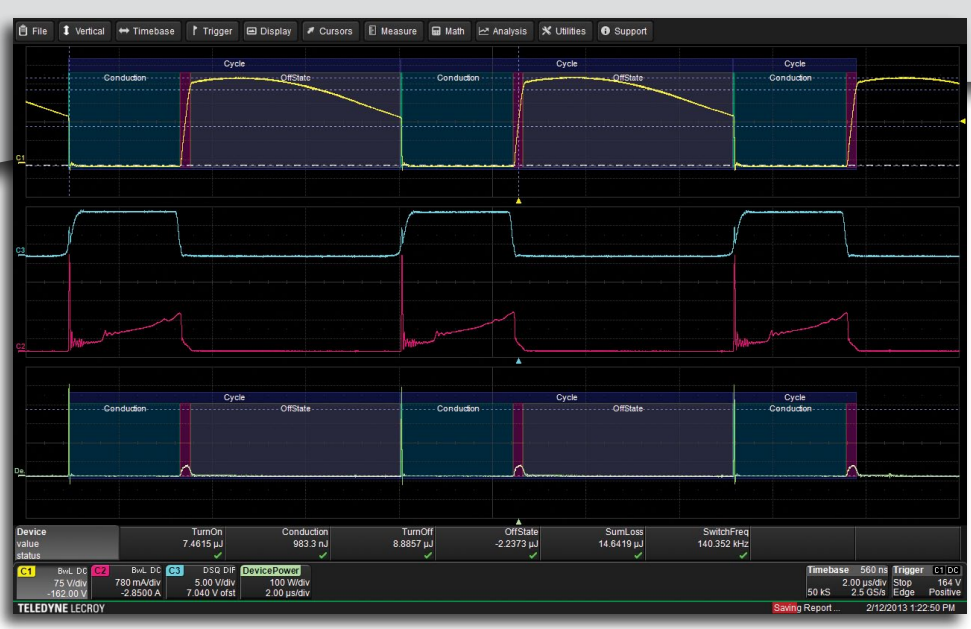
Automatically and accurately analyze the performance of switched-mode power circuits