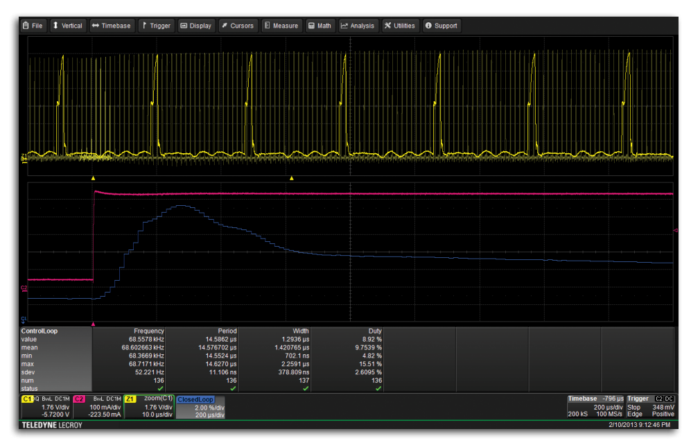
Triggered by the step change in load current (red trace), the gate-drive modulated signal (yellow traces) is captured, the closed-loop, time-domain response of the feedback loop (blue trace) is displayed, confirming loop performance.