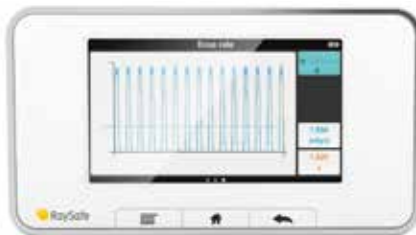
WAVEFORM Overview and simple analysis of kVp, dose rate or mA.