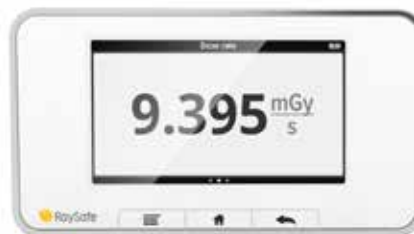
SINGLE VIEW Large view of selected parameter.