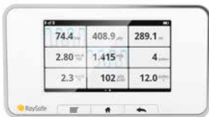
HOME SCREEN Measurement of 1 – 12 parameters simultaneously with waveform overlay.

All exposures are saved in the base unit. In each session, you can swipe to quickly go back to previous exposures for reference or comparisons. A full session of measurements can be uploaded to the X2 View software at a later stage for more manipulation.