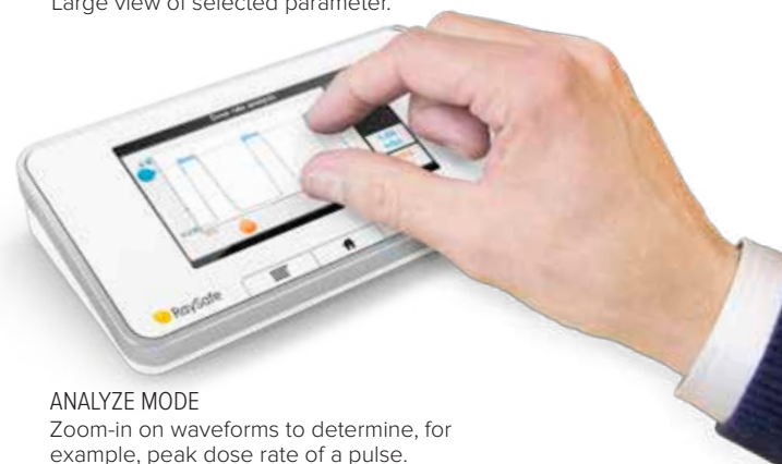
ANALYZE MODE Zoom-in on waveforms to determine, for example, peak dose rate of a pulse.